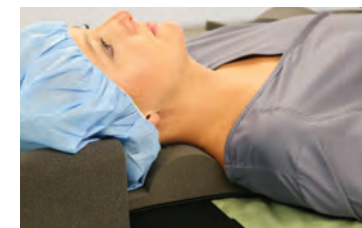
TrenGuard™ Trendelenburg Restraint