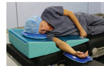
PatientGuard™ Lateral Positioner