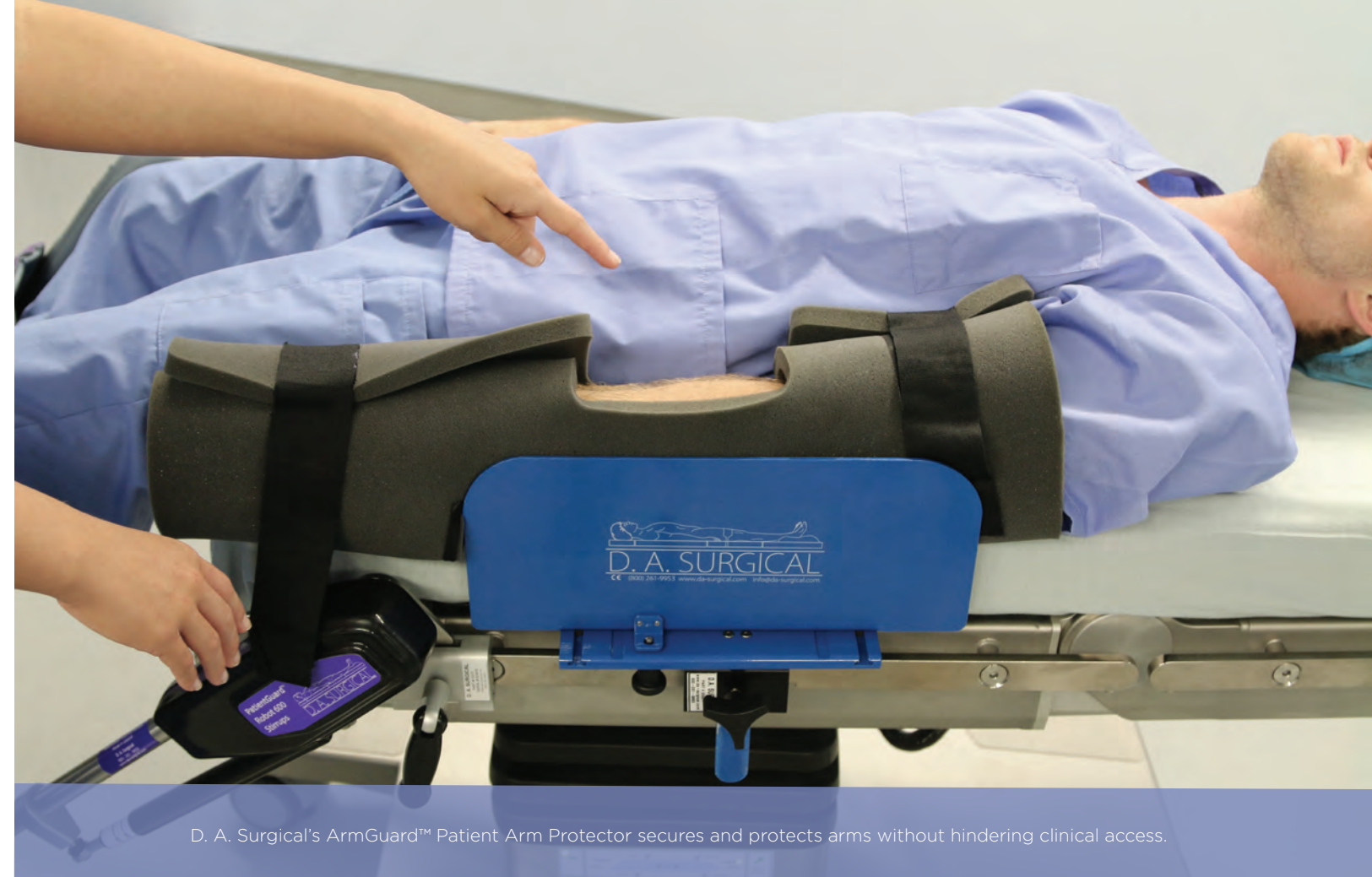
D. A. Surgical's ArmGuard™ Patient Arm Protector secures and protects arms without hindering clinical access.

Creating a safe environment for patients in the Trendelenburg position has always been challenging. Robotic surgery technology created patient safety risks that never presented with conventional minimally invasive surgery. These risks are exclusive to robotic surgery and require complete patient immobility to avoid patient injury. Even minimal patient sliding can result in unnecessary patient injury. The literature makes clear that patient sliding on the table