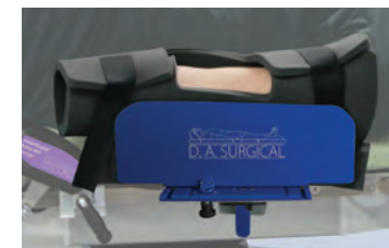
ArmGuard™ Arm Protector